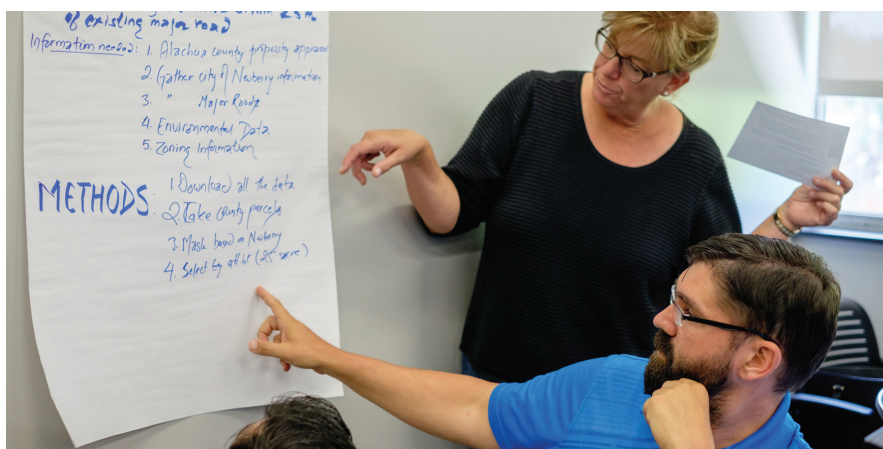
Florida Sea Grant GIS Workshop May 2017