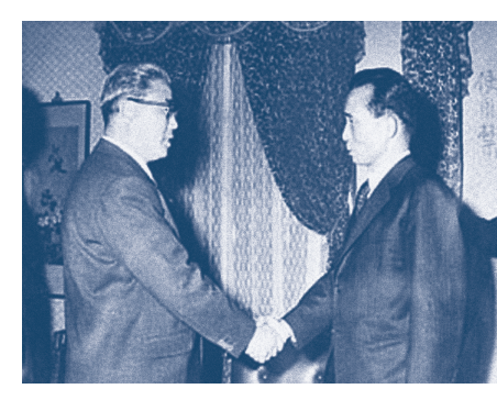
PAK SEONGCHEOL AND PARK CHUNG HE

So previous to these two developments, neither of the two Koreas had come up with any comprehensive unification policies, so there had been no room for the two sides to talk about unification per se. Instead, the North Koreans kept on being aggressive and proactive, talking about certain conditions for unification in the context of political negotiations and things like that, or certain conditions that North Korea imposed on South Korea allegedly for the purpose of creating condi-