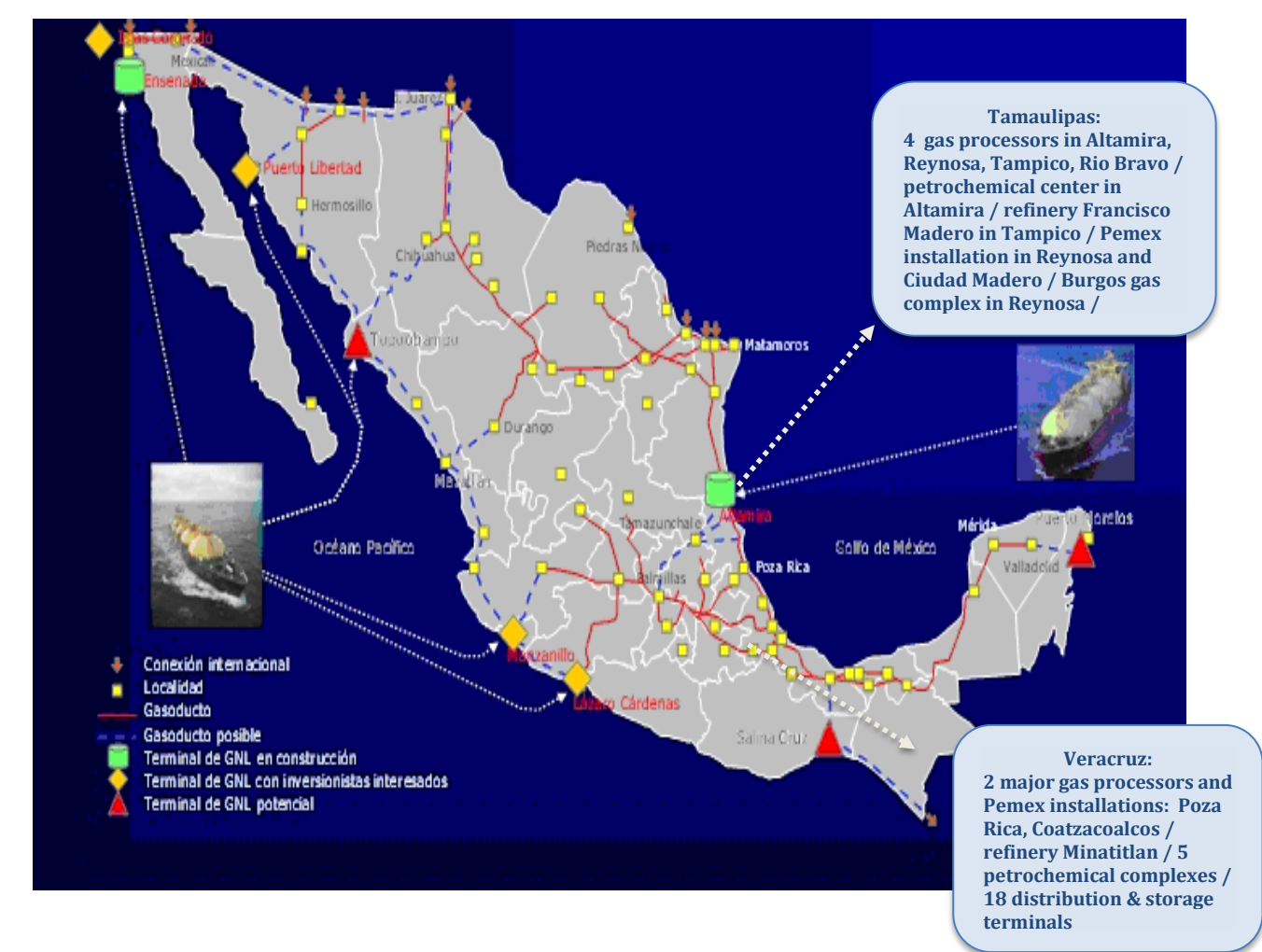
Image 1: Map of principal Pemex oil and gas installations in Tamaulipas and Veracruz<sup>1</sup>

• Negative public opinion over fracking in Veracruz, the impact of the Energy Reform bill on Pemex labor contracts and the oil and gas sectors marginally increased vis-à-vis the government's public relations campaign representing the commercial and security benefits of energy liberalization. The government is making some dents in the national public debate—notably in social media venues concerning the benefits of energy liberalization and public security. An increased security presence coupled with efforts at improving transparency and collaboration with civil society in the fight against organized crime also is a necessary step.