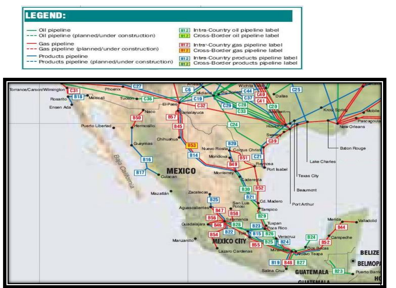
Image 3: Map illustrating Mexican-US interconnectivity of oil and gas pipelines<sup>2</sup>

• The established oil and gas infrastructure unifying Mexico and the U.S., particularly pipelines, planned infrastructure upgrades, and construction of additional supply routes contributes to consolidating the energy needs of both countries. Mexico will see its natural gas needs met for the foreseeable future by the pipeline projects currently under construction.<sup>1</sup>